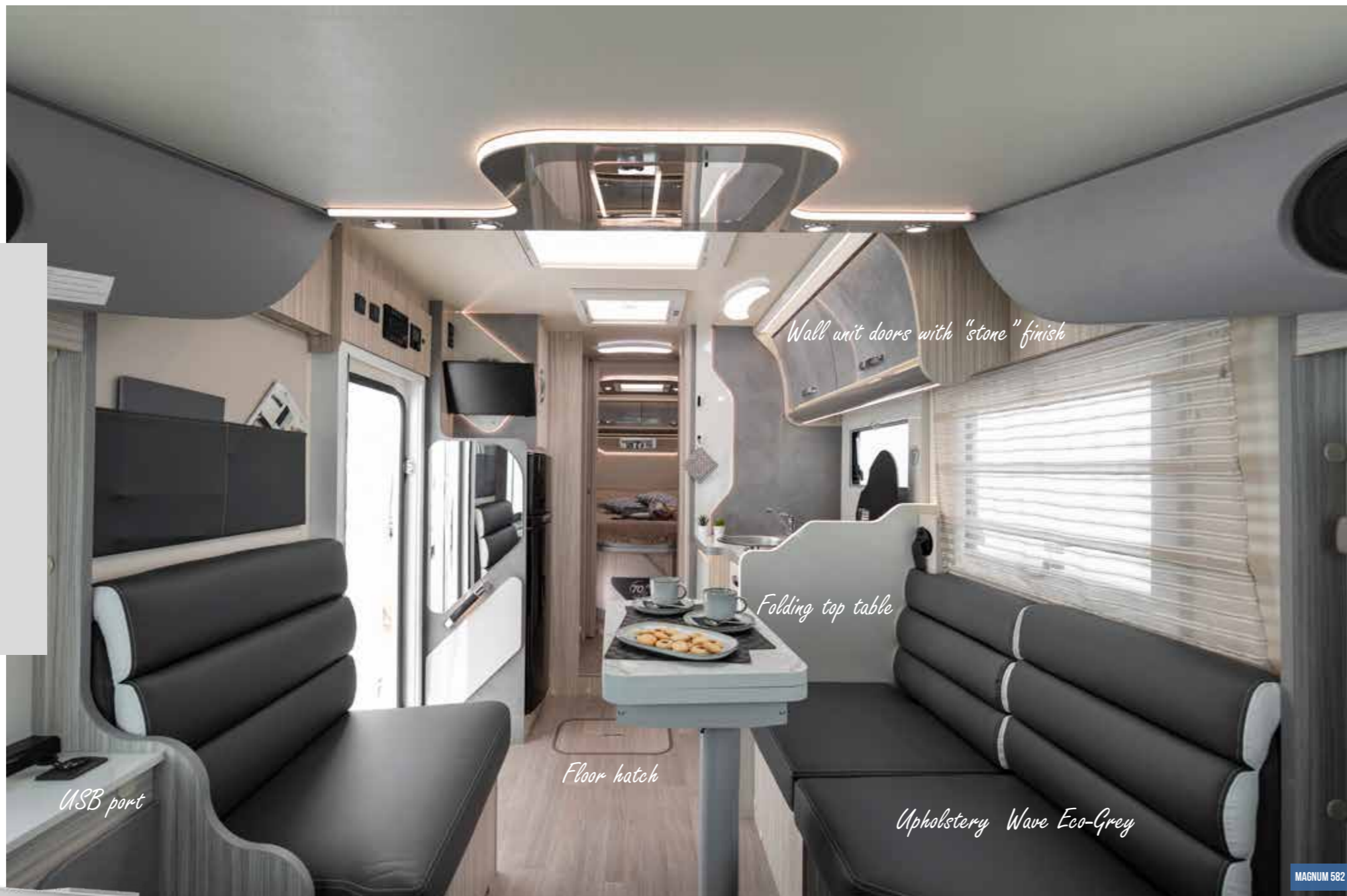
Wall unit doors with "stone" finish